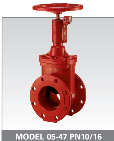
MODEL 05-47 PN10/16